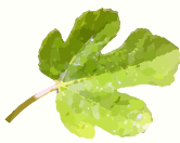
Fig Garden Woman's Club Board Meeting Minutes December 1, 2025