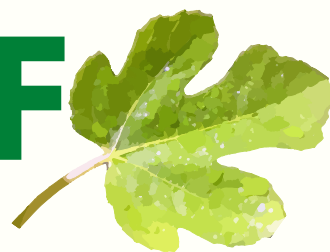
Fig Garden Woman's Club Newsletter Established in 1921