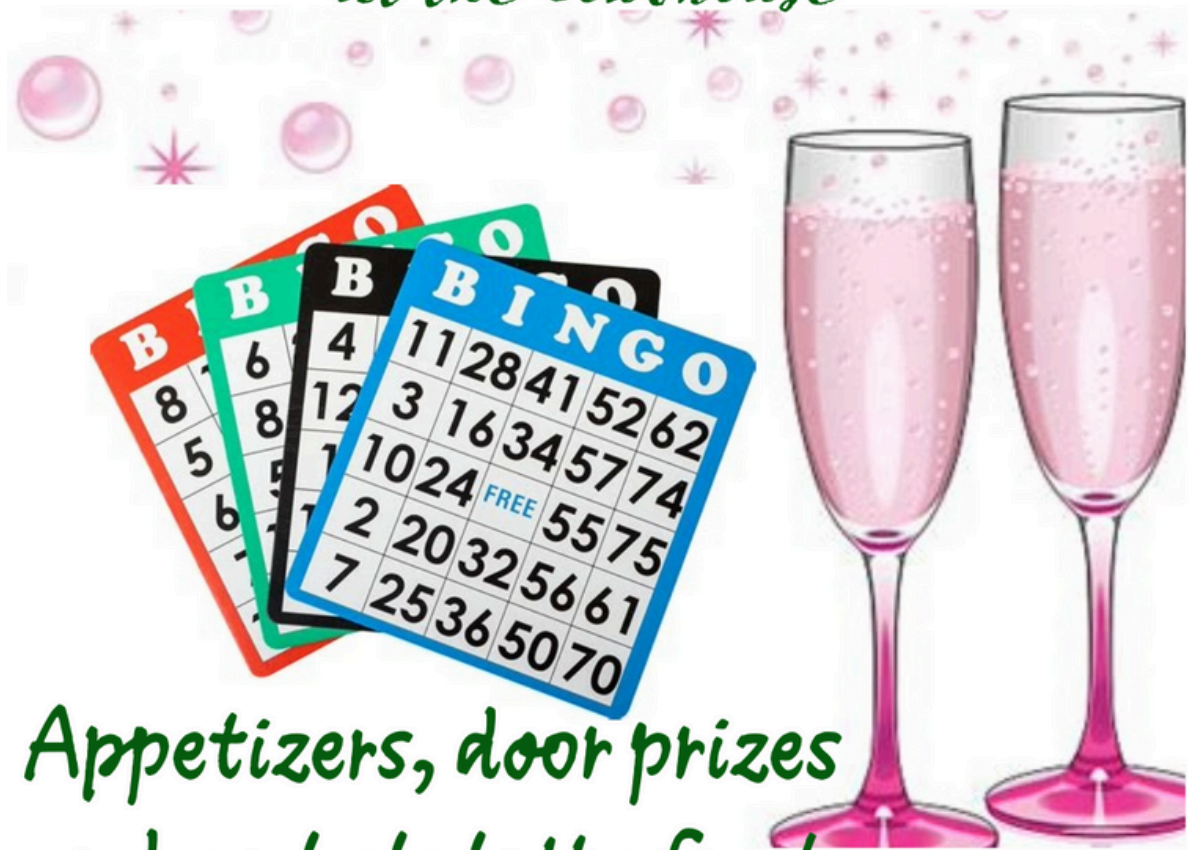
Fig Garden Woman's Club Bingo & Bubbly at the clubhouse

Appetizers, door prizes and a whole lotta fun!