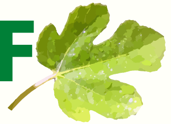
Fig Garden Woman's Club Newsletter Established in 1921