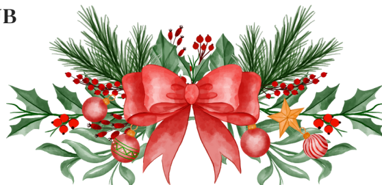
FIG GARDEN WOMAN'S CLUB