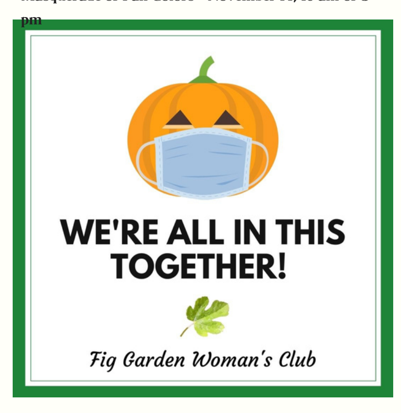
Fig Leaf submission deadline - November 20 Board Meeting - November 2, 9:30 am General Session/Social - November 11, 11:30 am - 1 pm Masquerade of Fall Colors - November 14, 10 am or 3